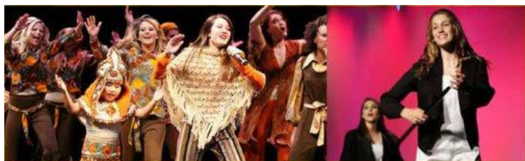
Entertainment Revue Wednesday, December 7, 2016 Free Holiday Show