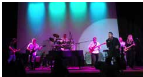
Turnstiles $18 Wednesday February 1, 2017